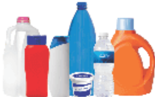
Plastic Bottles, Jugs, Tub, & Lids (Empty kitchen, laundry, & bath containers)