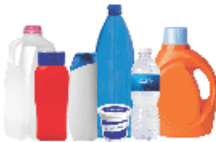
Plastic Bottles, Jugs, Tub, & Lids (Empty kitchen, laundry, & bath containers)