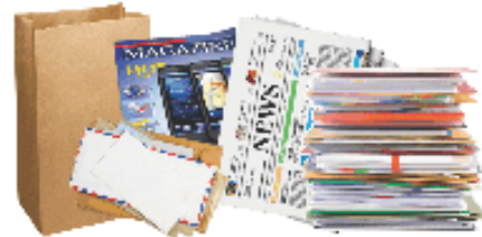
Junk Mail, Periodicals, & Office Paper (Paper bags, envelopes, & catalogs)