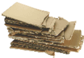
Corrugated Cardboard (Wavy center layer)